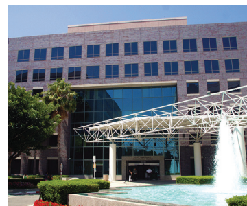
USC Healthcare Center 1 (HC1)