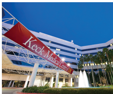
Keck Hospital of USC (KMC)