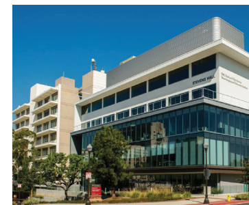
Stevens Hall (SHN)

Electric vehicles operate Monday through Friday, 8 a.m. – 5 p.m. They run every 10 minutes between USC Norris Cancer Hospital, HC 4, Keck Hospital, HC 1 and HC 2. They also are available on-call: from Keck Hospital, Gold Lobby (323) 442-9919, Cardinal Lobby (323) 442-8787; from USC Norris (323) 865-3176.