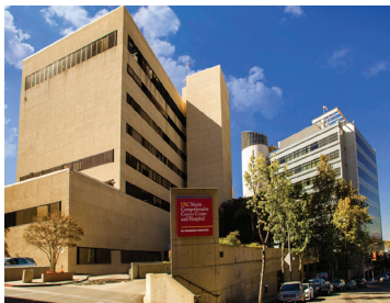
USC Norris Comprehensive Cancer Center and Hospital (NOR)